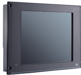
▲ Touch without keypad version