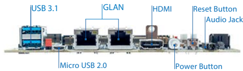
SOMDB7 Carrier Board Back I/O