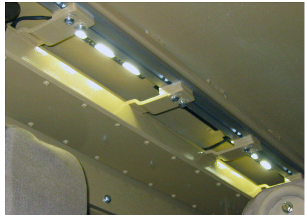
White mini floodlight system installed in the cabin of a military vehicle

The benefits of LED technology far outweigh that of incandescent technology. The requirement to store, replace and dispose of bulbs is eliminated, maintenance time is reduced and it provides significant through life cost and energy savings.